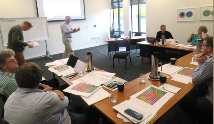
The E-Star studs at work in Christchurch

This is a massive step forward for the N.Z. commercial beef industry. The feedback from anyone that has read our bull catalogue is how easy it is now to draft off the bulls on paper that are best suited to your own bull buying requirements - simply by looking at the E-Star chart and then drilling down further into individual traits.